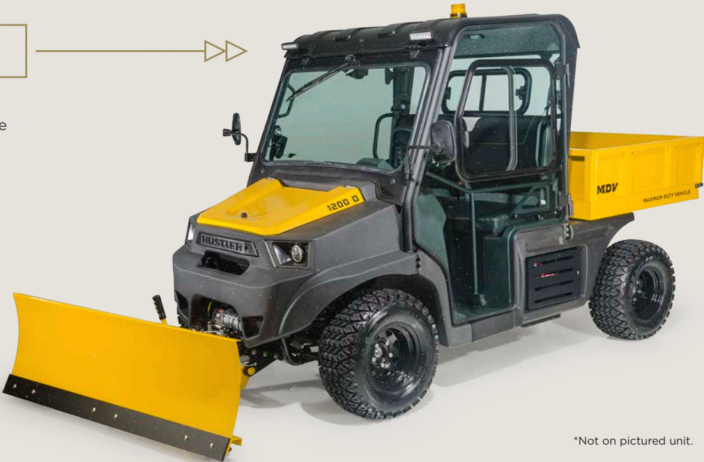
*Not on pictured unit.

Available for standard bed model. (Standard on Levelift model.)