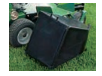
GRASS CATCHER: Jumbo