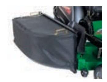
GRASS CATCHER: 5.0 Bushel