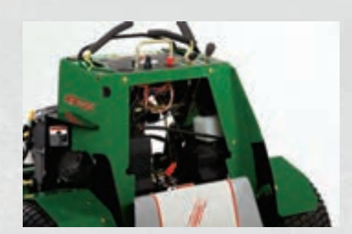
REMOVABLE RIDER PAD Convenient access for easy maintenance