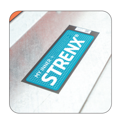
STRENX High-performance 700MC structural steel