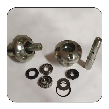
ROLLER BEARINGS Sealed internal roller bearings offer total protection against moisture, soil, and debris