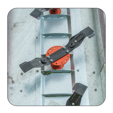
LONG-LASTING BLADES Produced from 1/4" sprung steel to offer hours of continuous work without needing to sharpen