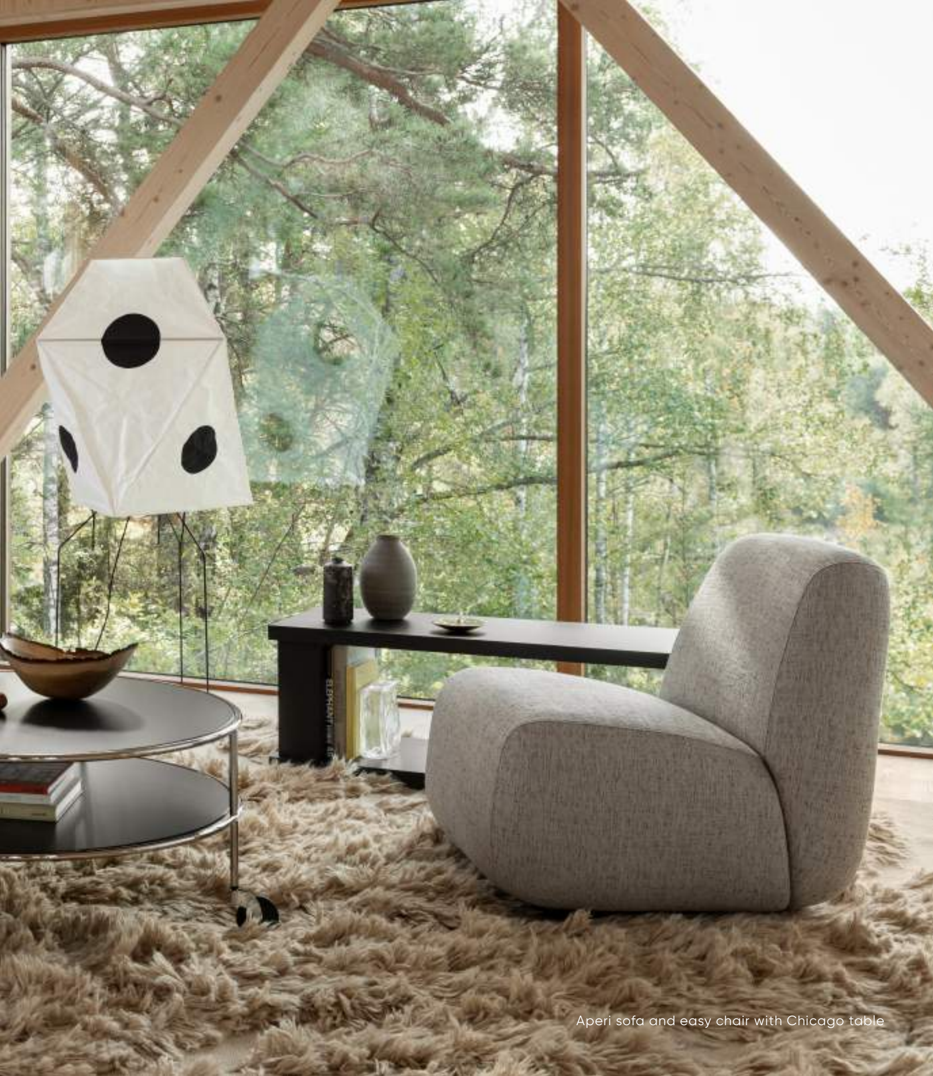
Aperi sofa and easy chair with Chicago table