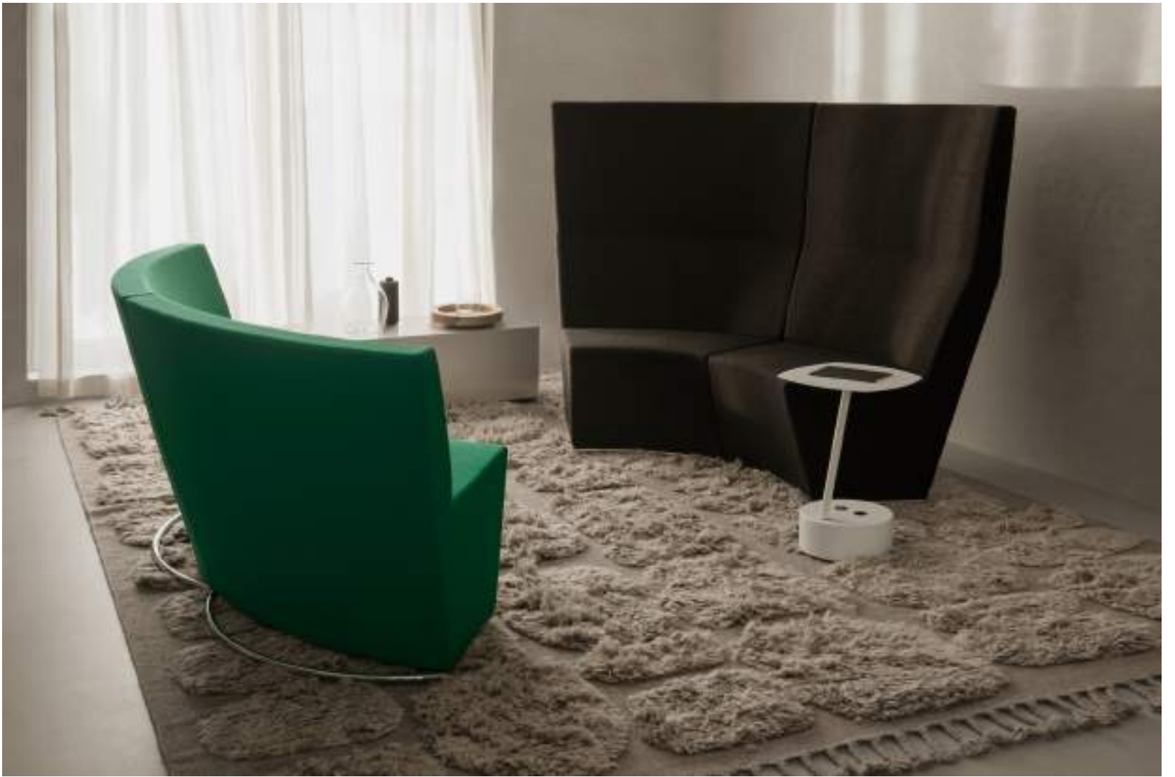
Area Radius sofa and Add Cable table