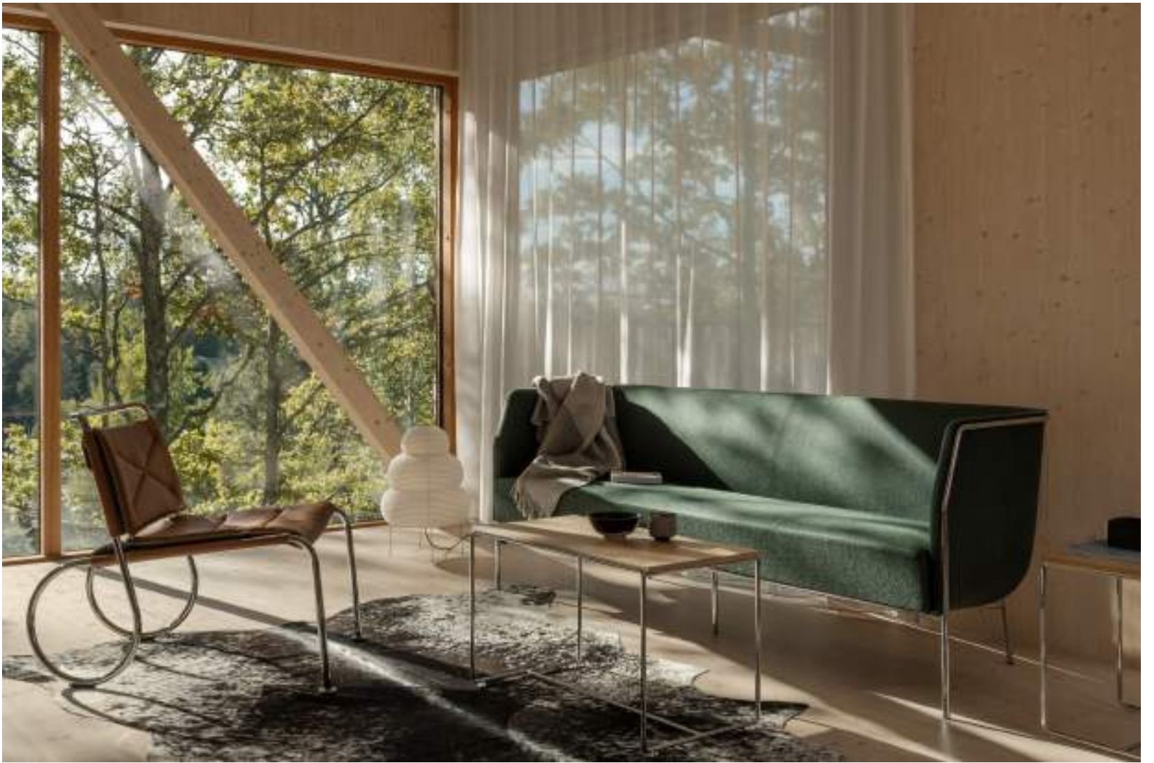
Cajal sofa and table with Corso easy chair