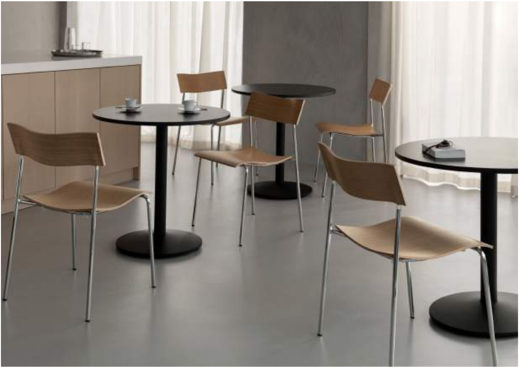
Campus chair and Campus Café table