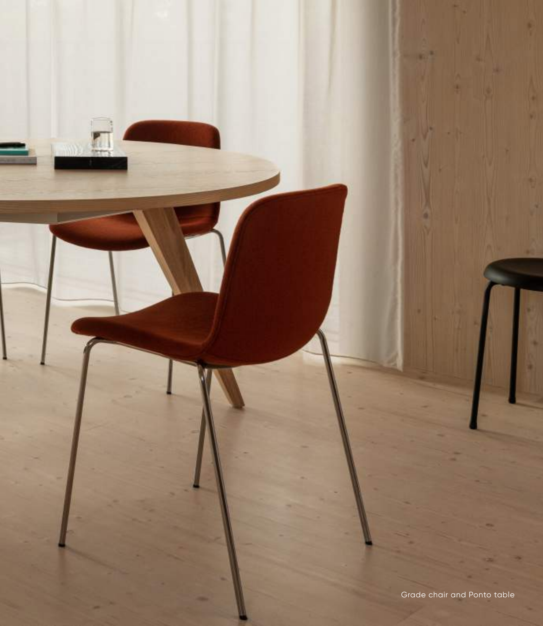
Grade chair and Ponto table