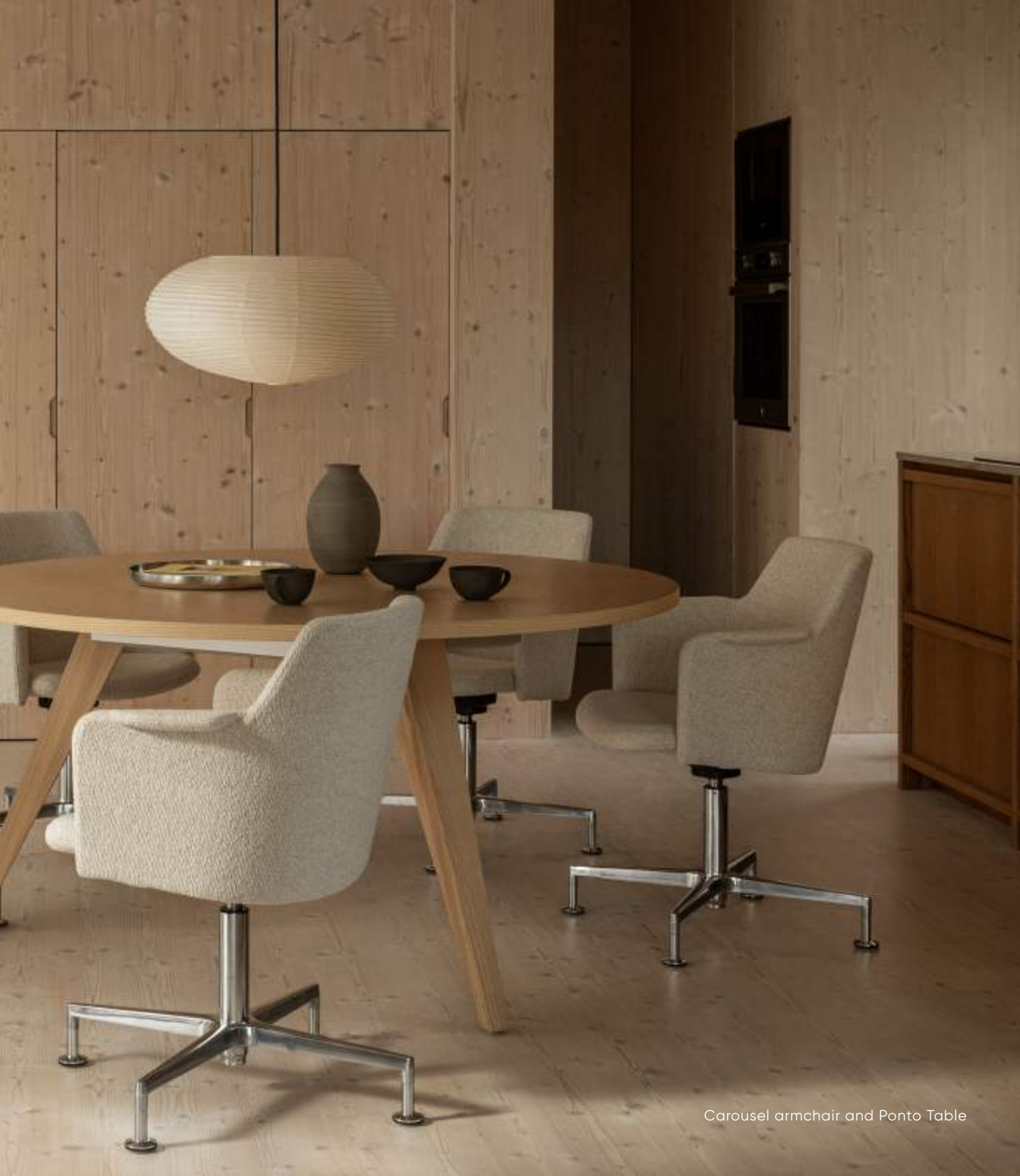
Carousel armchair and Ponto Table