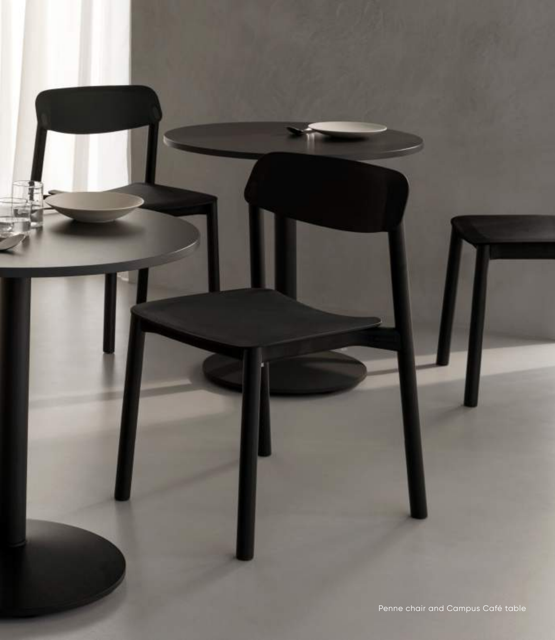
Penne chair and Campus Café table