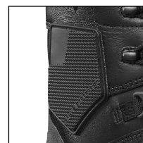
HAIX® Ankle Protector System