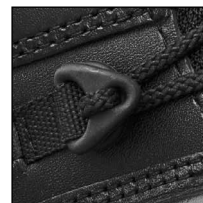
HAIX® 2-Zone Lacing