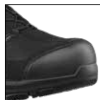
HAIX® Composite Toe Cap