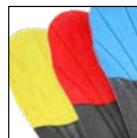
HAIX® Vario Wide Fit System