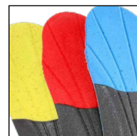
HAIX® Vario Wide Fit System