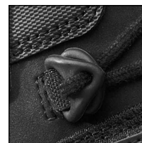
HAIX® 2-Zone Lacing