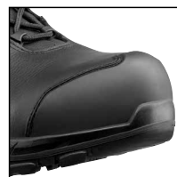
HAIX® Composite Toe Cap