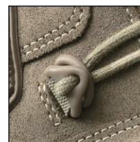
HAIX® 2-Zone Lacing