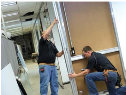
Like traditional movable wall, Evoke can be moved and reconfigured with ease, supporting change and saving both time and money.