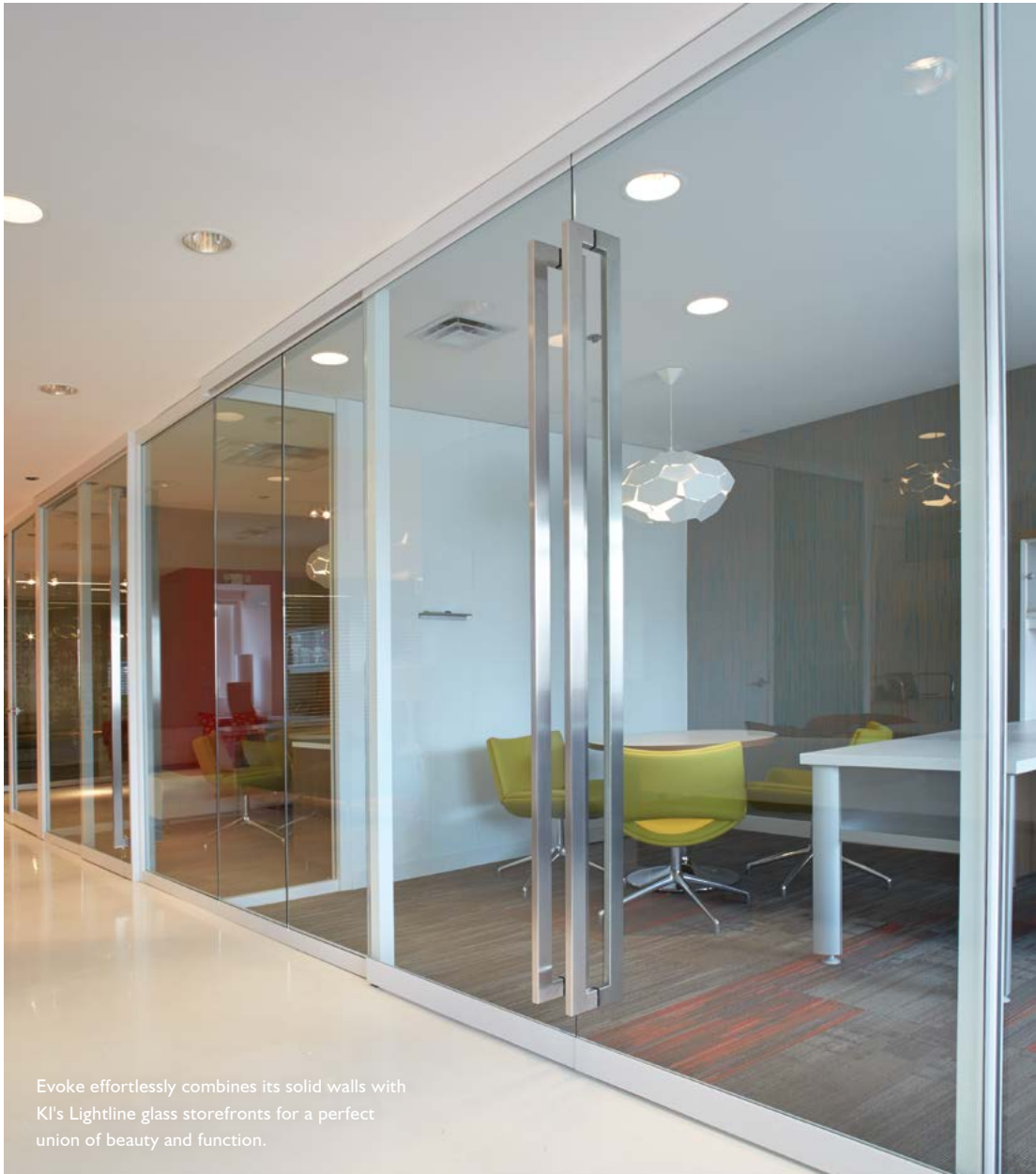
Evoke effortlessly combines its solid walls with KI's Lightline glass storefronts for a perfect union of beauty and function.

With a construction process as simple as permanent wall, Evoke installs faster and easier than drywall (and other traditional movable wall systems) and can also be quickly reconfigured with far less waste at a minimal cost — giving contractors, architects and designers alike an unprecedented level of control.