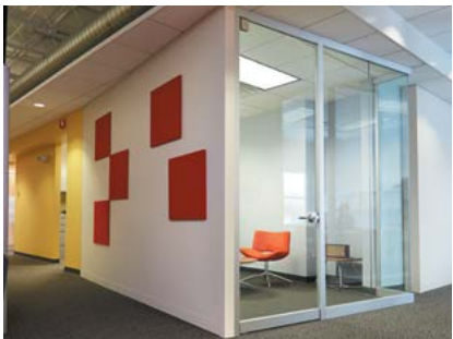
Easily change the look and function of Evoke walls with hang-on or magnetic accessories (such as tackboards, shown above) or by painting on-site.