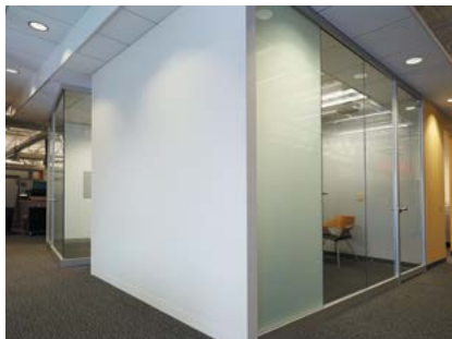
Like drywall, Evoke offers incredibly clean, passive aesthetics and nearly seamless panel-to-panel connections.