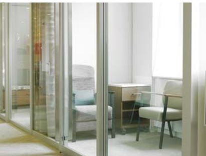
Evoke's highly-rated acoustics allow you to keep private conversations in and unwanted distractions out (shown above with Genius storefronts).