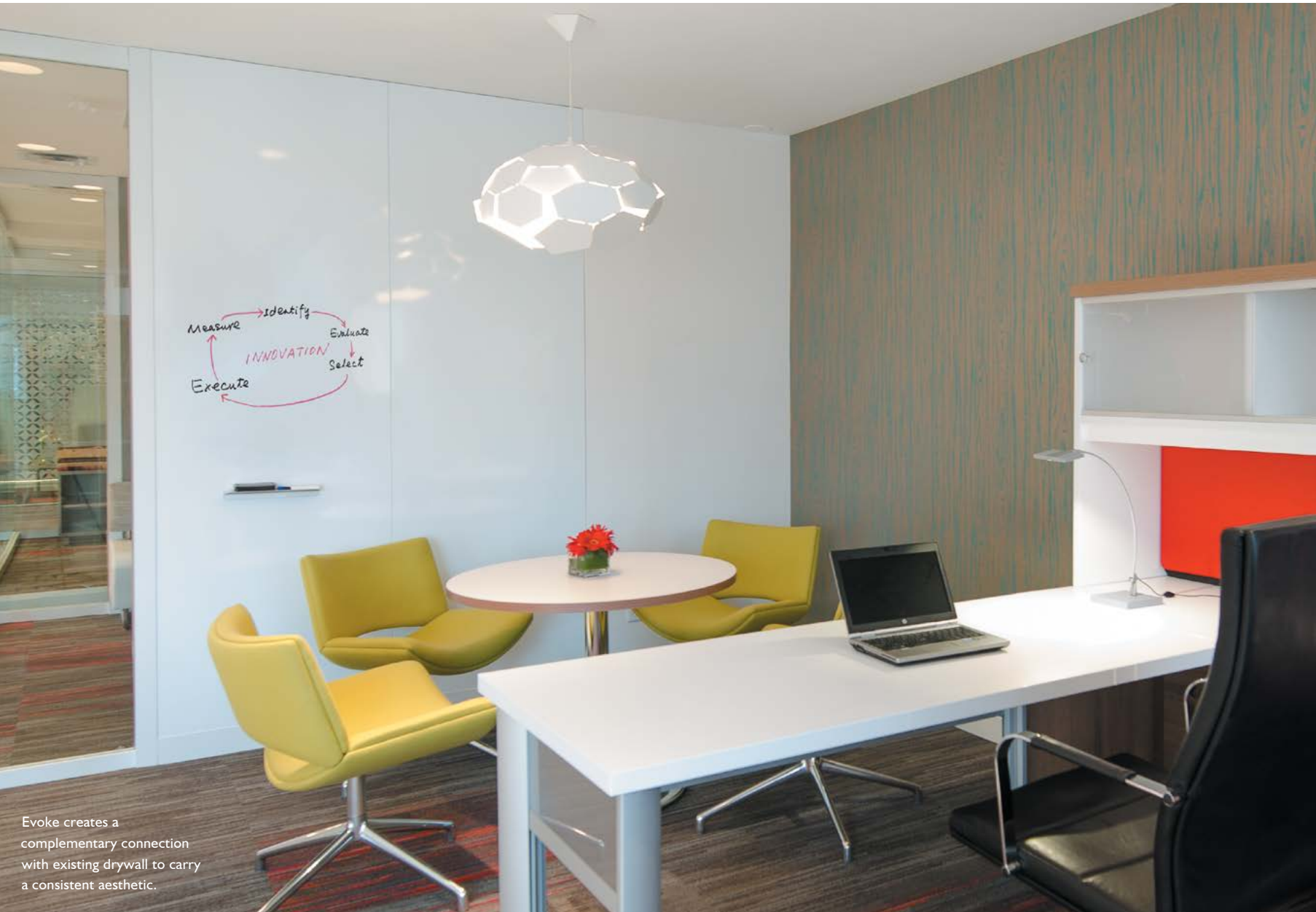
Evoke creates a complementary connection with existing drywall to carry a consistent aesthetic.

Working in concert with existing drywall as well as KI's Lightline and Genius architectural walls, Evoke's performance is inimitable. And with a Sound Transmission Class (STC) performance rating up to 50, its acoustics are unbeatable, in turn minimizing distractions and maximizing productivity.