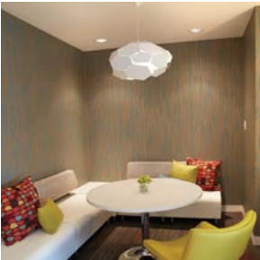
WALLPAPER OR VINYL WRAP

Evoked is a breakthrough alternative to drywall that is changing everything — from the minds of architects to the hearts of designers. Now you have the freedom to express yourself in ways once thought unimaginable with a wall system. Featuring the passive aesthetics of drywall with virtually seamless reveal lines, Evoked is as flexible as traditional movable wall, yet is screen printable, wrappable, and even paintable in the field — anything but dry.