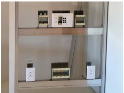
Power outlets and infeeds can be placed on-site and are easy to move up or down and right or left as needed.