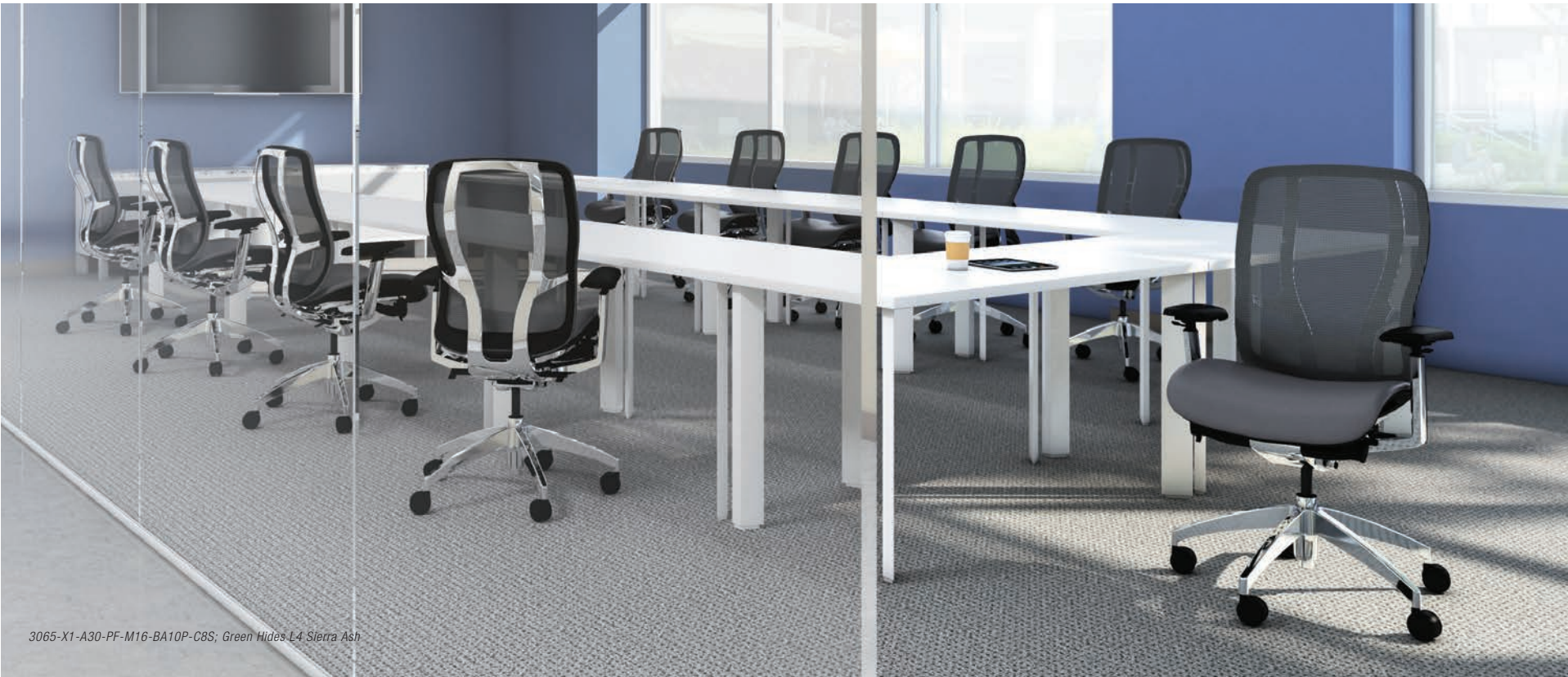
3065-X1-A30-PF-M16-BA10P-CBS; Green Hides L4 Sierra Ash