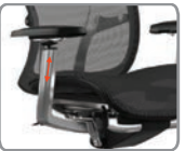
A29 HEIGHT ADJUSTABLE ARM WITH 17.5" INTERIOR WIDTH