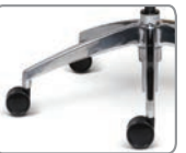
BA10P 26" HIGH PROFILE ALUMINUM BASE POLISHED