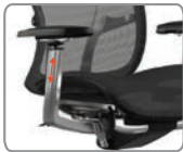
A28 HEIGHT ADJUSTABLE ARM WITH 19" INTERIOR WIDTH