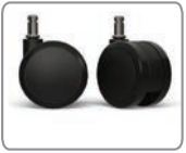
C8S LARGE DIAMETER HARD FLOOR AND CARPET CASTERS