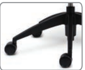
BA10B 26" HIGH PROFILE ALUMINUM BASE BLACK POWDER COAT