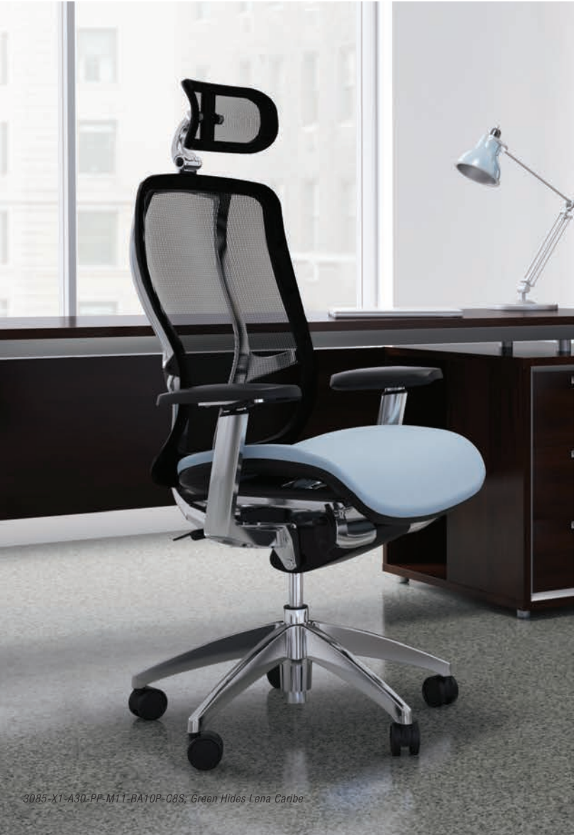
3085-X1-A30-PF-M11-BA10P-CBS; Green Hides Lena Caribe