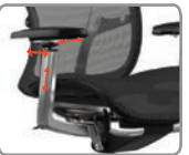
A30 HEIGHT/WIDTH ADJUSTABLE ARM WITH SLIDING PAD