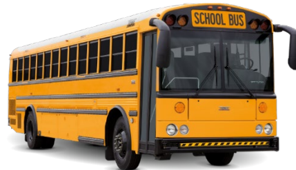
Rear Engine Style