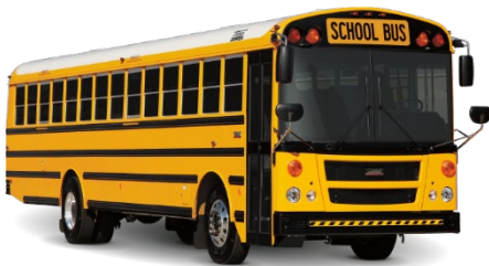
Front Engine Style

A Type D school bus is a body installed upon a chassis, with the engine mounted in the front, mid bus, or rear with a gross vehicle weight rating of more than 10,000 pounds. The engine may be behind the windshield and beside the driver's seat; it may be at the rear of the bus, behind the rear wheels; or between the front and rear axles. The entrance door is ahead of the front wheels. This type is also known as "transit-style school bus."