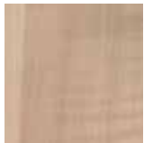
Hardrock Maple (HM)