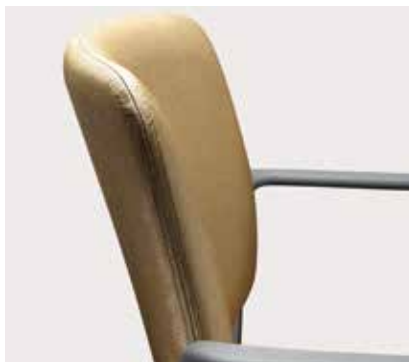
Compound-curved back provides a snug fit