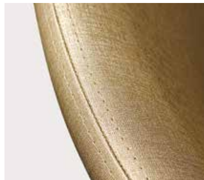
Double-stitch method increases durability and provides a cleaner appearance