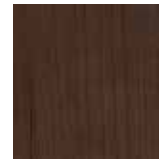
Cherry Blossom (CB)