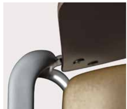
Chair design allows for easy cleaning and eliminates potential bacteria traps