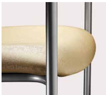
"Waterfall" front edge design enhances comfort and eliminates a potential pinch point