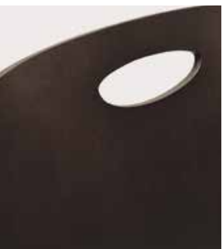
back available in three unique cut-out designs. Custom cut-outs also available