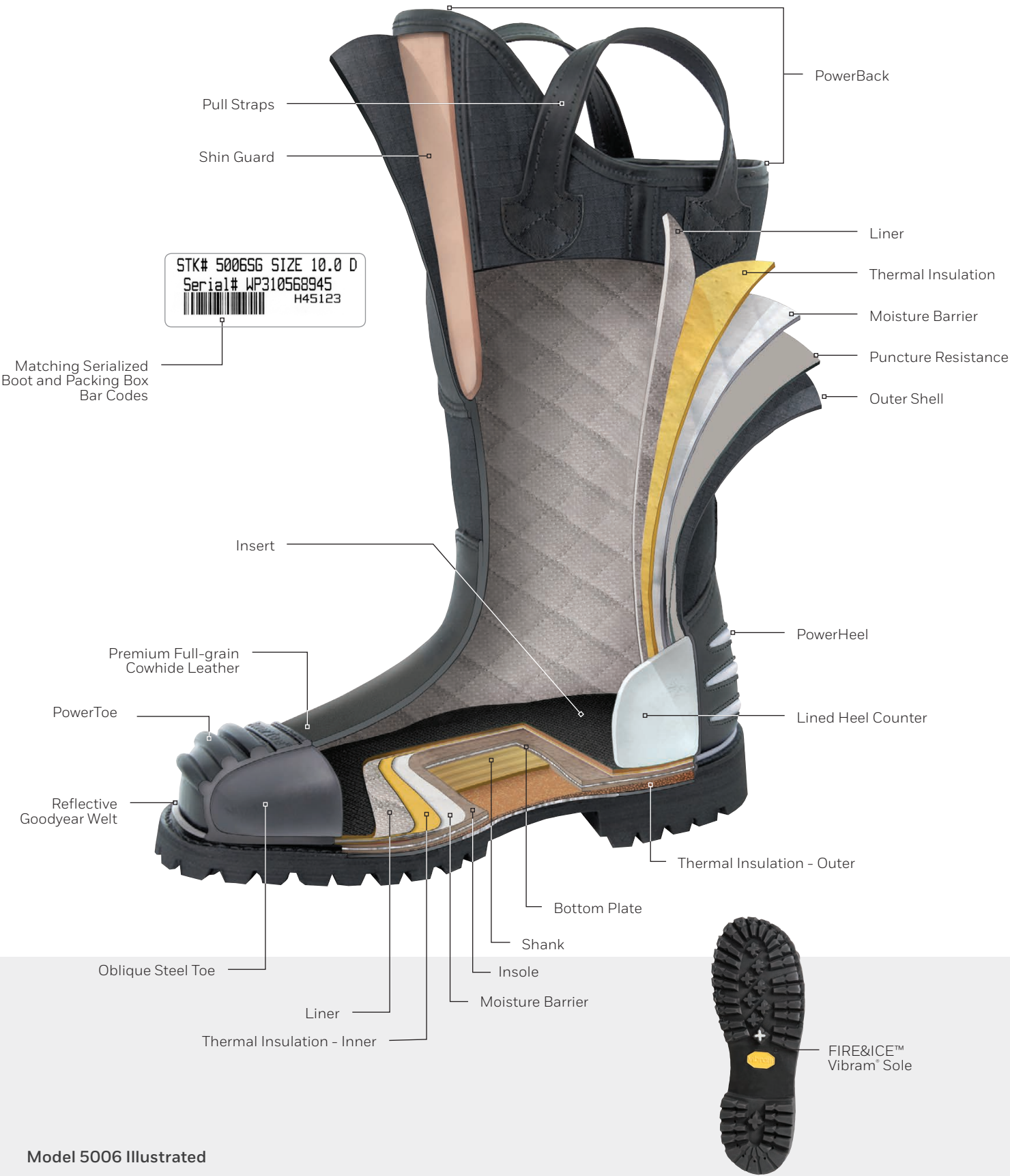
Model 5006 Illustrated