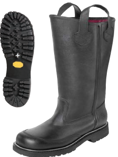
MODEL 5050B – Struximity