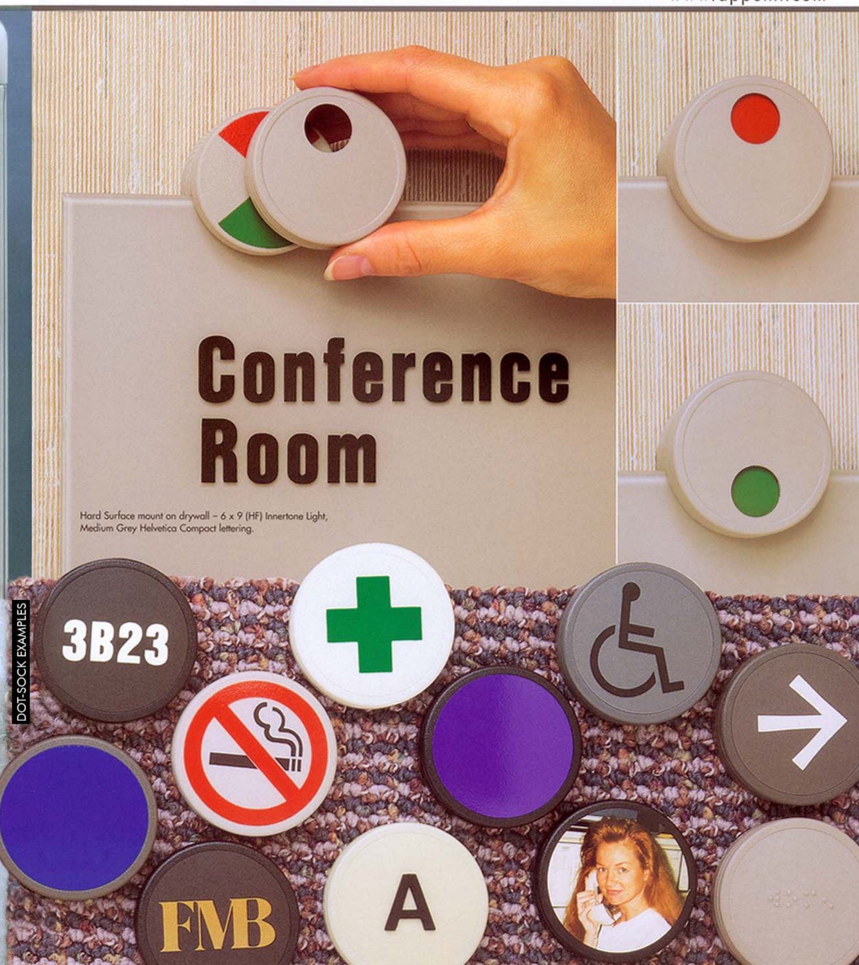
Hard Surface mount on drywall – 6 x 9 (HF) Innertone Light, Medium Grey Helvetica Compact lettering.