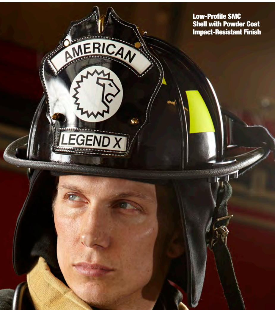
Low-Profile SMC Shell with Powder Coat Impact-Resistant Finish

NOTE: Additional cover material options are available.