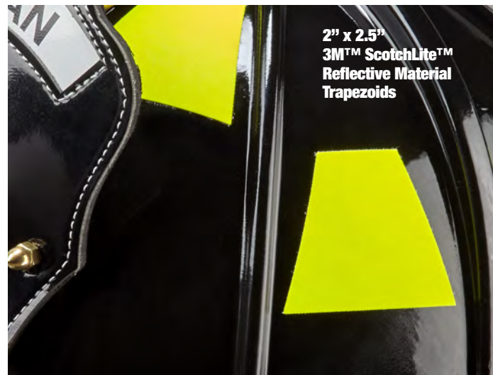
2" x 2.5" 3M™ ScotchLite™ Reflective Material Trapezoids