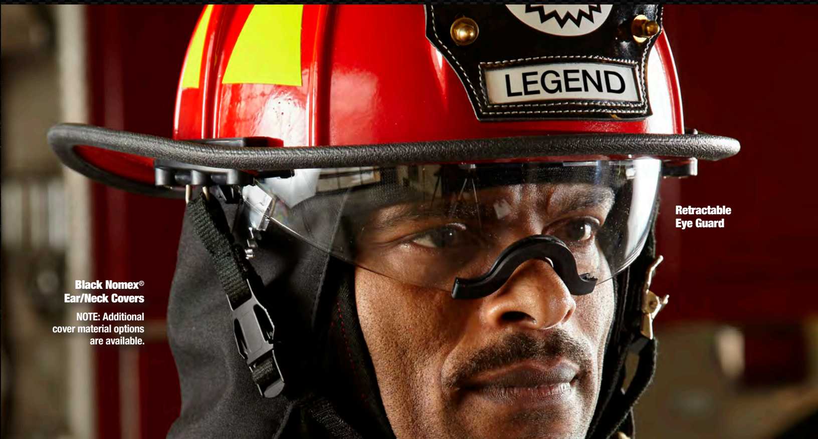
Retractable Eye Guard