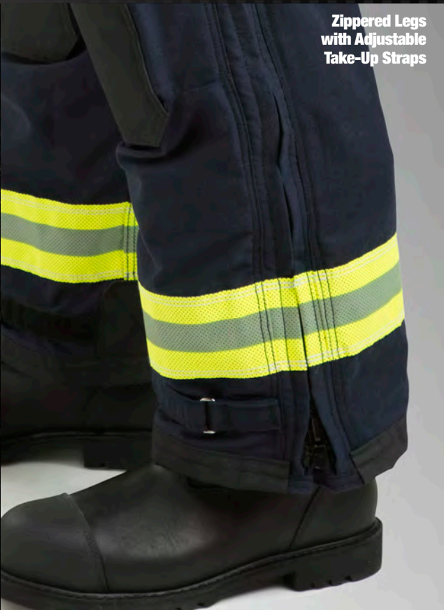
Zippered Legs with Adjustable Take-Up Straps