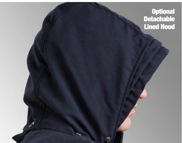
Optional Detachable Lined Hood