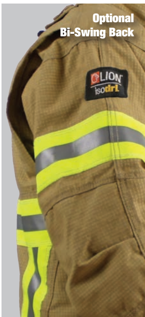
Optional Bi-Swing Back