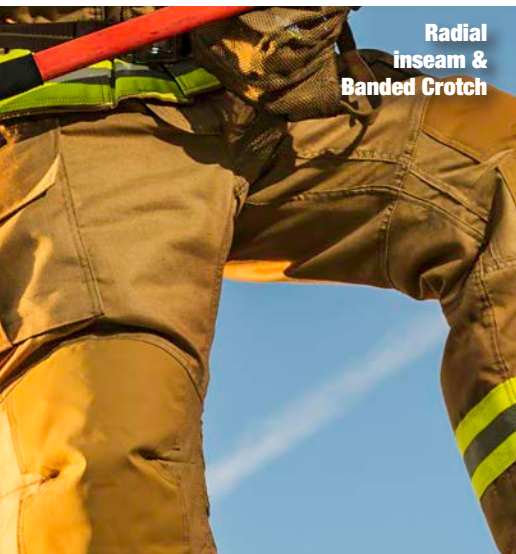
Radial inseam & Banded Crotch