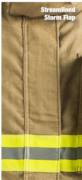
Streamlined Storm Flap