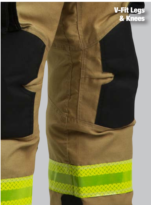
V-Fit Legs & Knees