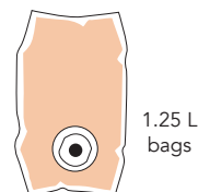
1.25 L bags