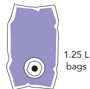
1.25 L bags