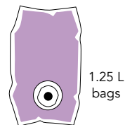
1.25 L bags