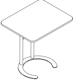
24" x 30" Rectangular Table CMDGA2430 (26" Fixed-Height) CMDAA2430 (29" Fixed-Height) CMDEA2430 (Adjustable-Height)