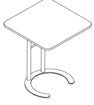
Square Table CMDGC26 (26" Fixed-Height) CMDAC26 (29" Fixed-Height) CMDEC26 (Adjustable-Height)