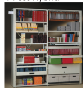
QuadraMobile Expandable Modular System