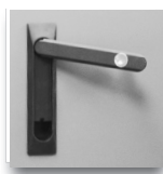
Swivel Recessed Handle