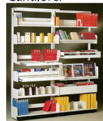
Quadral Lateral Storage System