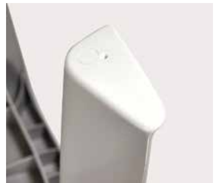
Feet bottoms feature pilot hole indicator to facilitate bolt down option