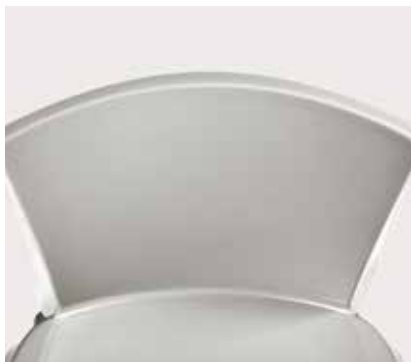
Low back design more resistant to tipping or rocking