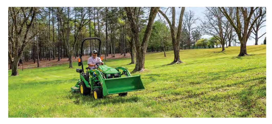
The 1025R features standard cruise control, allowing you to maintain constant speed with the pull of a lever.