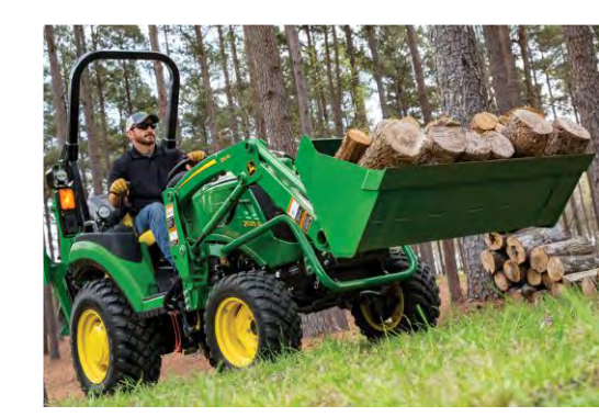
From snow removal to digging and every task in between, John Deere and Frontier implements not only do it all, they do it all better and quicker.

Get behind the wheel of a John Deere Compact Utility Tractor, and discover the sweet spot where big-tractor features meet intuitive, easy-to-use controls. Operators will appreciate powerful standard features like four wheel drive (4WD), hydrostatic transmission, cruise control, power steering, and drive-over mower deck compatibility, for starters – the 2025R, 2032R and 2038R models pack quite a punch. But these are not one-trick ponies; from finish-mowing and loader chores to backhoe work and snow removal, the 2R Series give it their all – so you can work to your full potential. Add in smart options like Quik-Park™ loaders and iMatch™ quick attach hitch and you'll understand why we say the best things come in 2s.