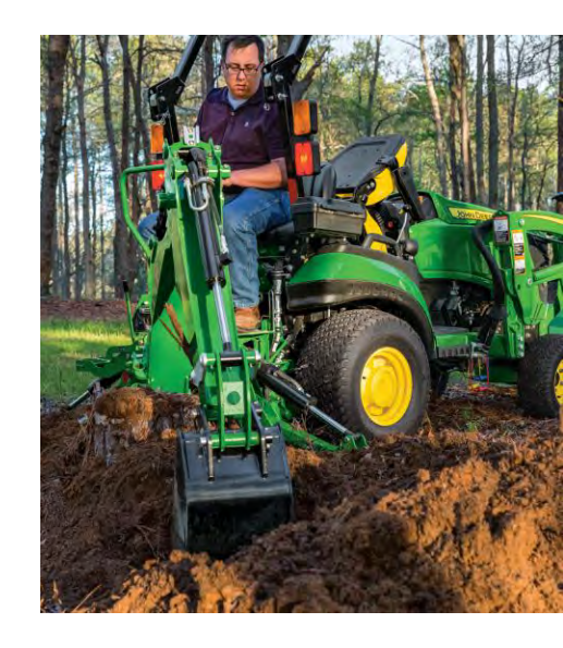
This backhoe was designed for optimum performance without compromising the integrity of the tractor frame, transmission, and other components.

One look at the John Deere 1 Series and you can see that it's a lot more than just a sub-compact tractor. It's also a landscaper, a snow mover, and a finish mower. A gardener, a lawn seeder, and a fence-builder. All those tasks (and more) are made easier by smart features like iMatch™ Quick-Hitch compatibility, AutoConnect™ Mid-Mount Mower decks, dial-type height of cut setting, and 3-point hitch with implement position control. In every nut and bolt, you'll see fine-tuned engineering, designed, tested and assembled in Augusta, Georgia USA. You'll get the perfect combination of customer input and more than 180 years of experience. But mostly, you'll experience ease of use, ride comfort, and attachability that makes these the 1 for just about everything.