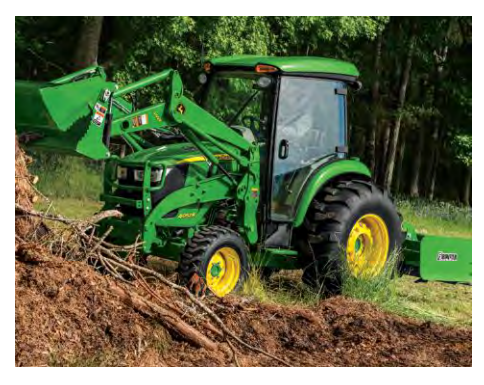
Improved HVAC – Be productive all year round with the 4R's new, improved, climate-control system. Rake hay in the heat, blow snow in the cold, and everything in between – all from the comfort of the cab.

You'll want to get familiar with the 4 Series. With up to 66 engine horsepower, standard four-wheel-drive, and eHydro transmission, you're going to like what you see. The new models in the lineup are 4M Heavy Duty Tractors. These models feature a low ROPS hinge point for tight, small spaces, 4 work lights, large industrial tires for great control in the mud and sludge, and a Category 1, 2 Three-Point Hitch to make switching between category 1 and 2 rated implements easy. All standard. The factory-installed hydraulics and telescoping draft links help too. This is strength and versatility. To the power of 4. For 485A Backhoe compatibility, the power of 4 digs in with 4M and premium 4R Tractors. While the open station 4M has all the basics, with the 4R you get advanced HST controls like Cruise control and SpeedMatch™, Hitch Assist system that speeds and simplifies 3-point implement hookups, compatibility with Quik-Park™ Loaders, and your choice of open-station or cab models. Add the dozens of implements and attachments available from John Deere and Frontier, and you'll see why the 4 Series has become king of the compacts.