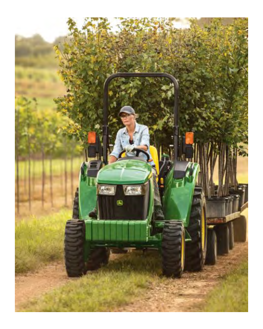
The 3D is a simple, powerful, compact tractor perfect for hauling wagon loads of material and product through narrow, uneven tracts in vineyards, orchards, nurseries, spinach farms and almond farms.

Then there's the latest addition to the 3 Series Small Tractor lineup. The mighty 3D. You'll get simplicity and power all in a compact size with a simple gear drive transmission (8F/8R), a heavy-duty drivetrain, up to 43 HP, a tight turning radius of 5.3 ft (1.63 m), and four-wheel drive. The perfect wagon hauler for tight narrow tracts and simplicity itself to use and maintain.