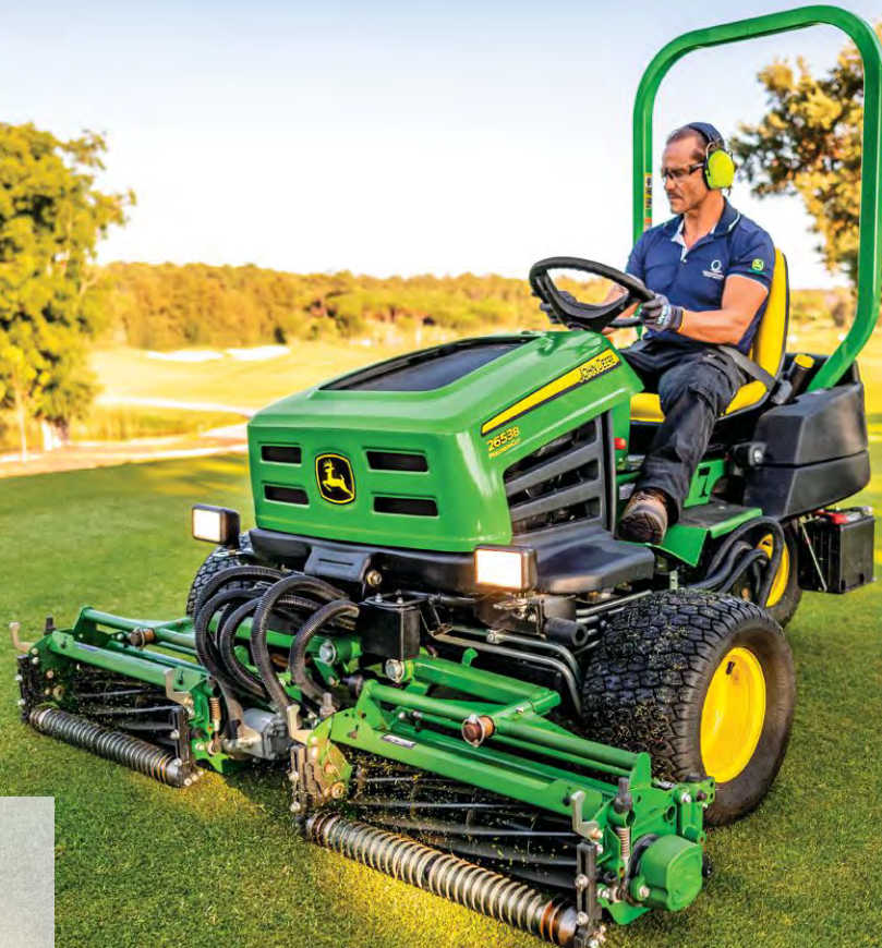
7400A Terrain Cut Trim and Surrounds Mower Light Kit, Sun Shade, Scraper Kit, Joystick