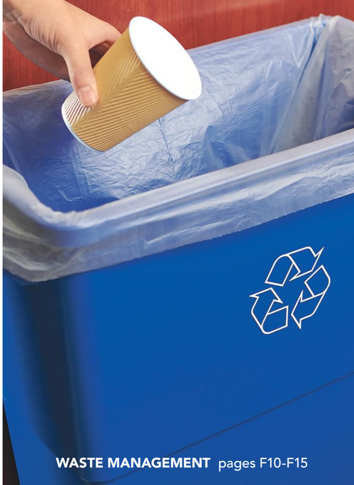
WASTE MANAGEMENT pages F10-F15