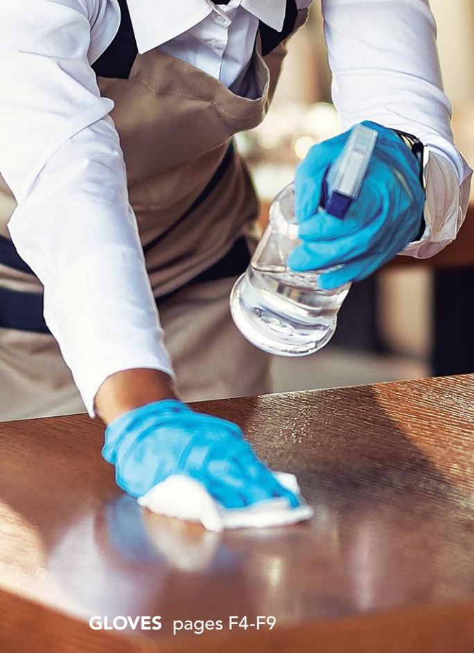
GLOVES pages F4-F9