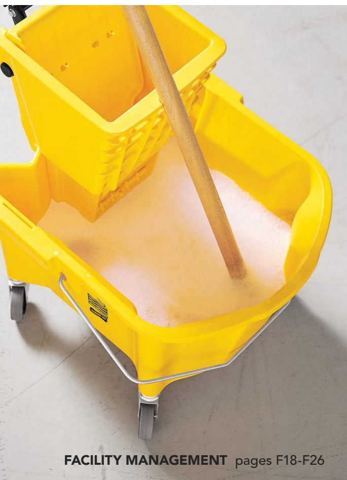
FACILITY MANAGEMENT pages F18-F26