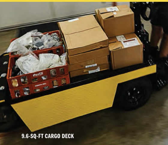
9.6-SQ-FT CARGO DECK