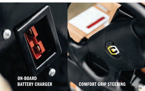
ON-BOARD BATTERY CHARGER