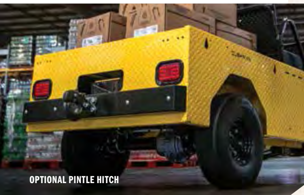
OPTIONAL PINTLE HITCH