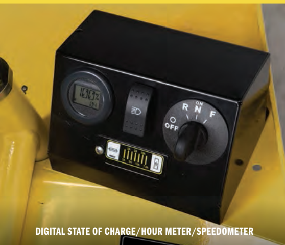
DIGITAL STATE OF CHARGE/HOUR METER/SPEEDOMETER