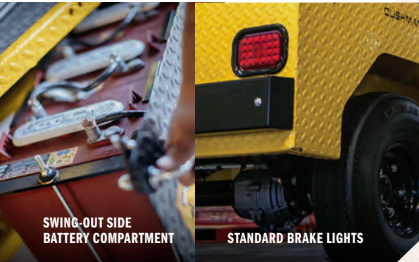
SWING-OUT SIDE BATTERY COMPARTMENT