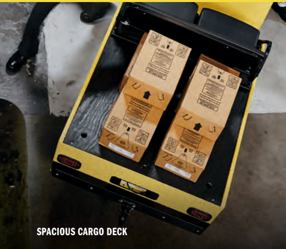
SPACIOUS CARGO DECK