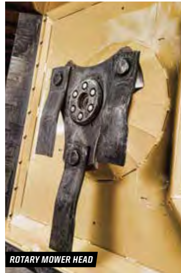
ROTARY MOWER HEAD