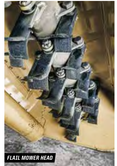
FLAIL MOWER HEAD