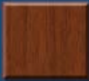
Antique on Cherry