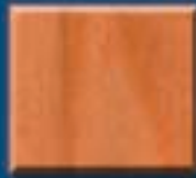
Clear on Cherry