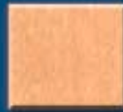
Clear on Maple