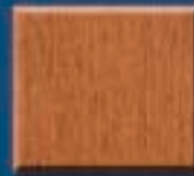
Antique on Maple