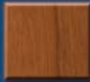
Porcelain on Cherry