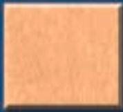
Clear on Birch