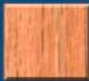
Clear on Oak