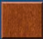
Porcelain on Maple