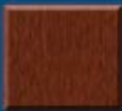
Victorian on Maple