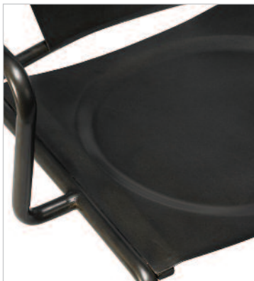
Contoured seat for exceptional comfort

From our industrial seating collection. Available in 18" or 30" seat heights.