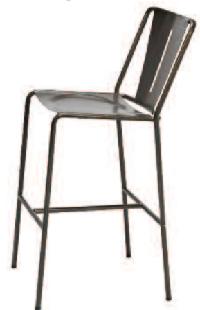
Angled back adds to comfort