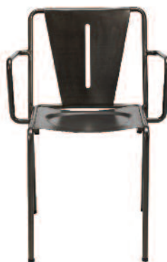
Sleek industrial design