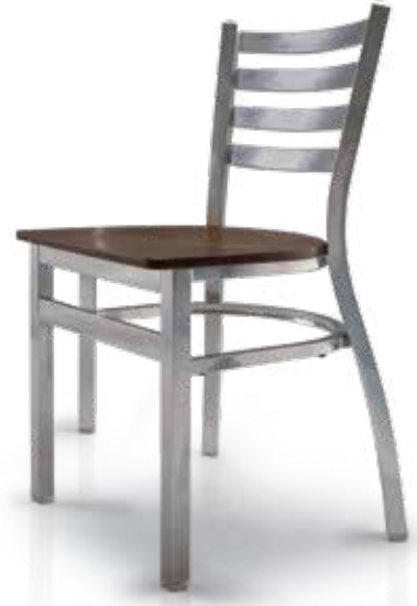
Standard metal stacking ladder back with wood seat