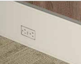
Power and data is distributed and accessed horizontally in the 6" base option.