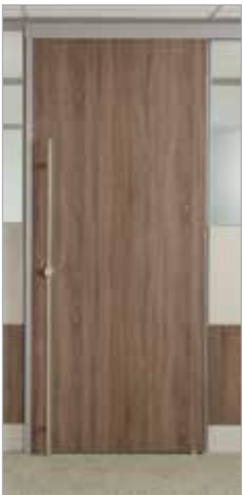
Wood Flush Sliding Door **