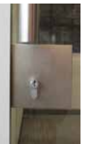
Sliding Door with Patch Lock. Option for Frameless Glass Sliding Door only.