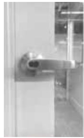
Swing Door Lever Set shown with SFIC lock option (COM core).

Insert Tiles create an extra-slim profile, revealing aluminum frame elements for a contemporary aesthetic. Choose Vinyl, Laminate, Veneer and Tackable Tiles for functional and design flexibility.