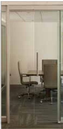
Frameless Glass Sliding Door