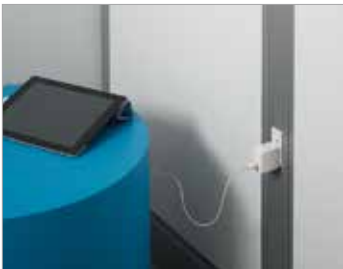
Inline Connectors support power and data vertically for access at multiple heights.