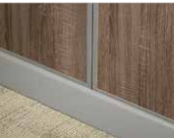
4" Vinyl Base frames the panel and resembles a commercial cove base.