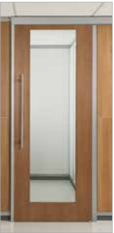
Wood Full Lite Sliding Door