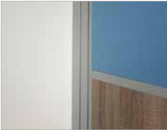
Adjustable Wall Starts provide flexibility to cleanly attach and adjust to walls, columns, and other architectural conditions.