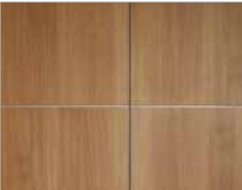
Outserts sit slightly proud of the frame and display a subtle 1/4" reveal.