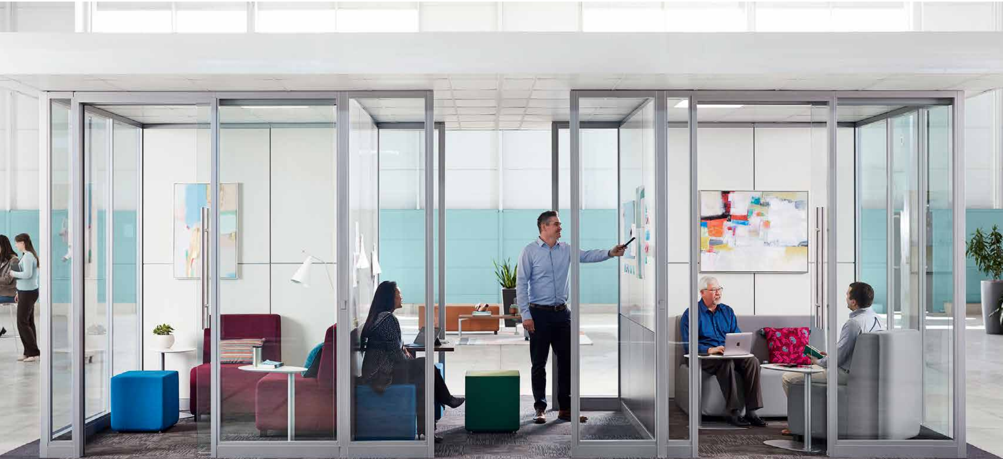
Volo can provide a quiet retreat (in a very small footprint) for heads-down concentration or private conversation.

Tailor your space to achieve the acoustic privacy you desire and create quiet areas for working or meeting. Depending on the materials and design, you can realize an STC rating of up to 43, comparable to full-height, insulated drywall.