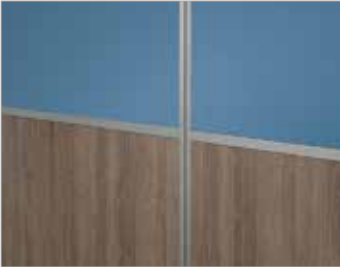
Slim-profile Inserts offer many decorative and functional options.