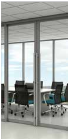
Double Glass Sliding Door