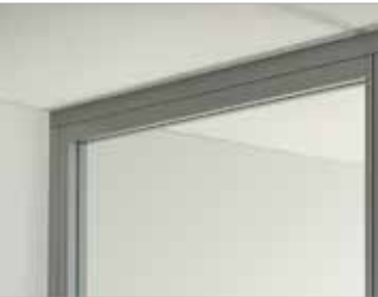
Traditional Crown stands slightly proud of the wall panel. Required for freestanding applications.