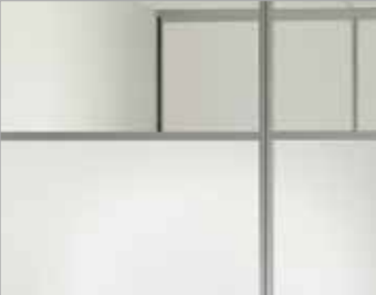
Volo offers Clear, Low Iron, Frost, magnet-friendly, Back Painted glass and writable glazing options.