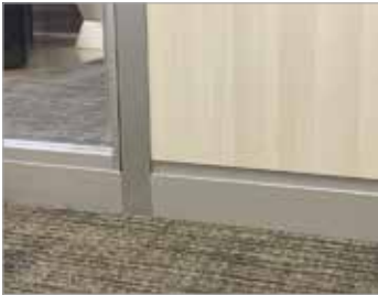
Aluminum Base provides a clean, architectural look.