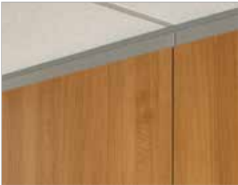
Reveal Crown creates a subtle ceiling attachment transition.