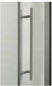
18" Sliding Door Post Pull.**