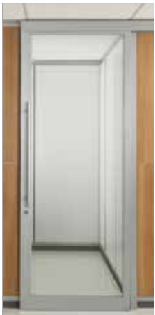
Aluminum Framed Sliding Door