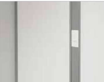
Inline Connectors can be specified with factory-cut openings to accommodate your choice of components.