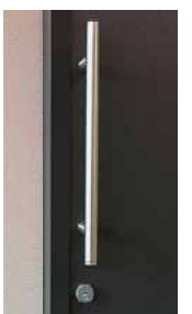
18" Sliding Door Post Pull with standard lock (non-SFIC). Small Format Interchangeable Lock (SFIC) available.