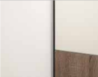
Reveal Wall Starts provide a subtle, recessed wall interface.