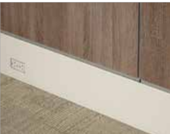
6" Vinyl Base accommodates horizontal modular power.