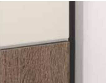
Volo has the capacity to provide acoustic privacy as good as or surpassing drywall.