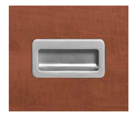
Inset pull is reinforced to withstand pressure