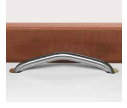
Bed features optional restraint loops