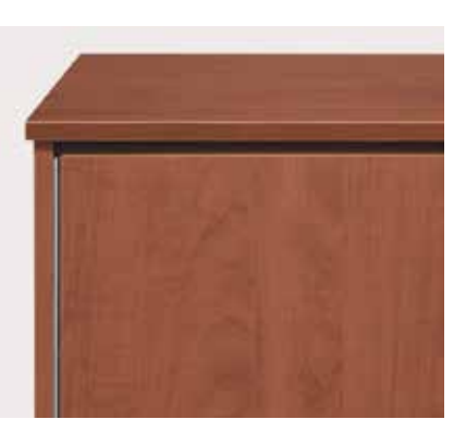
Wardrobe features sloped top to eliminate concealment