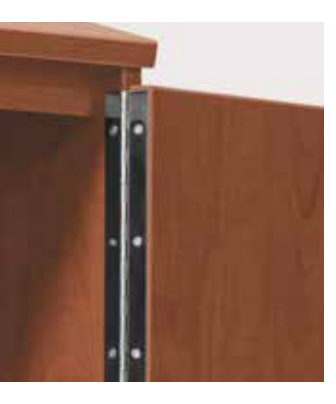
obe piano hinge increases durability