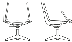
GGRA16-141 Guest, mid back, polished arms