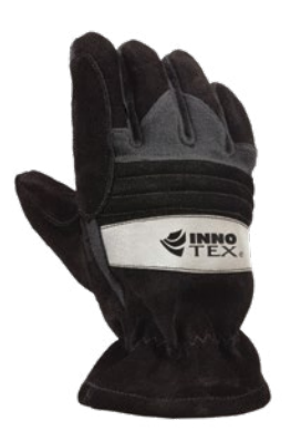
Black Eversoft Split Cowhide Shell & Kevlar Knit

Proven protection and abrasion resistance.