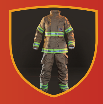
FXR Turnout Gear