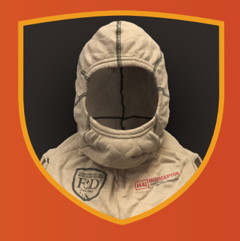
H41 Interceptor Hood