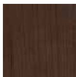
Cherry Blossom (CB)