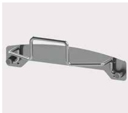
Bracket allows chair to store tight against the wall. Two designs available