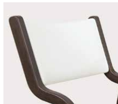
Contoured seat and back cushions provide ergonomic comfort