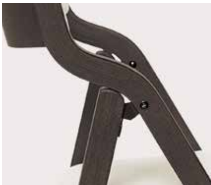
Frame design eliminates pinch points and risk of chair folding unintentionally