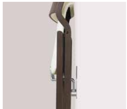
Stored chair depth is less than 7 inches