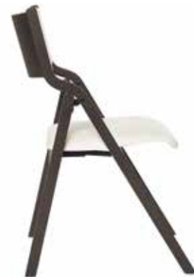
Kite folding chair (side view) shown in Enviro Leather Cactus fabric, with Chocolate finish