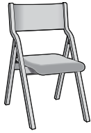
Kite Folding Chair with wood back Model No. KT300-WDB W 19 D 22.75 H 32 Seat H 18 Seat W 16.25 Weight 16