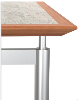
wood knife (reverse knife available)