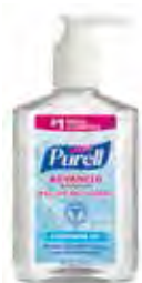
PURELL 8 oz Bottle