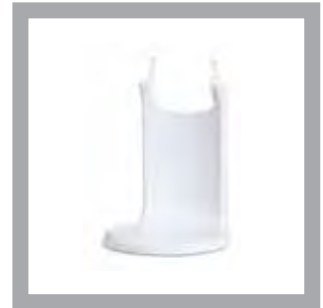
SHIELD™ Floor & Wall Protector