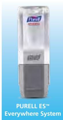
PURELL ES™ Everywhere System