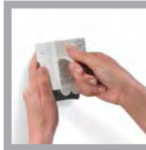
Adhesive wall mount (Included)

The PURELL ES™ Everywhere System offers four mounting options to provide the utmost versatility for every placement need. Plus, the optional SHIELD™ Floor & Wall Protector helps protect walls from drips and splashes.