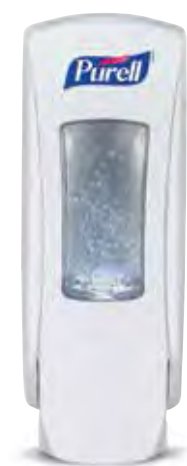
PURELL® ADX-12™ Dispenser