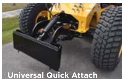
Universal Quick Attach