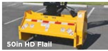
50in HD Flail