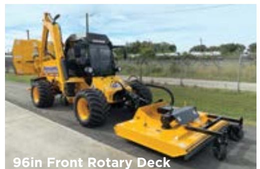
96in Front Rotary Deck