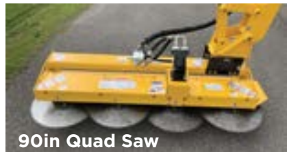
90in Quad Saw