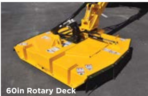
60in Rotary Deck

The MowerMax Boom is extremely versatile with 4 different boom head attachments as well as the optional front lift arms with universal quick attach mounts that allows you to use over 30 common skid steer attachments.