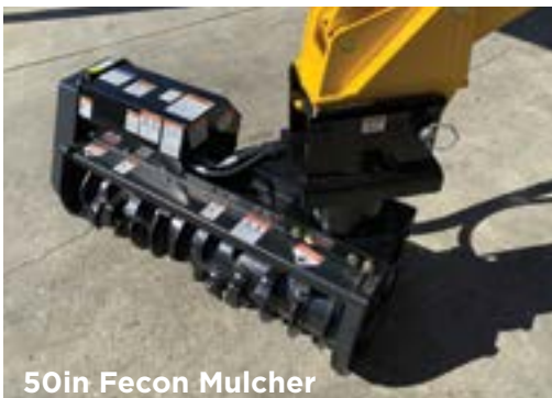
50in Fecon Mulcher