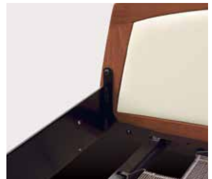
Inner steel seat frame adds weight and durability