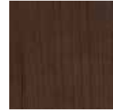
Cherry Blossom (CB)