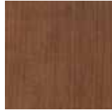
Rustic Cherry (RC)