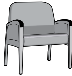
Heavy-Duty Bariatric chair