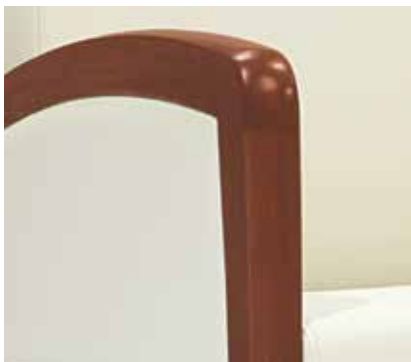
Closed arm panel available in upholstery or laminate