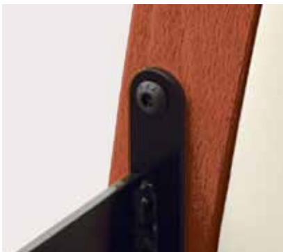
Tamper-resistant fasteners secured to metal inserts