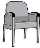
Heavy-Duty Guest chair