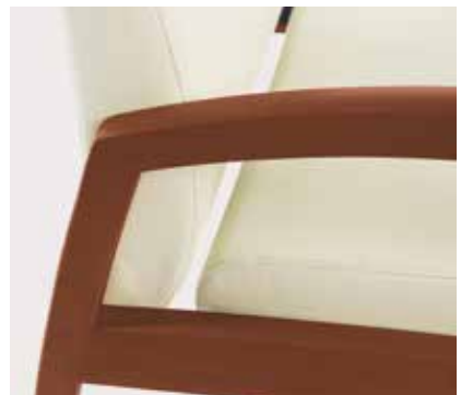
Separate seat and back for easy cleaning