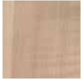
Hardrock Maple (HM)