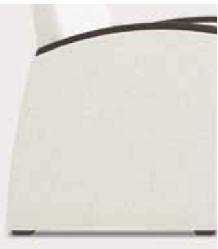
Wall saver rear leg design protects wall from damage