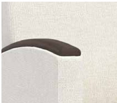
Optional armcaps available in wood, polyurethane or solid surface