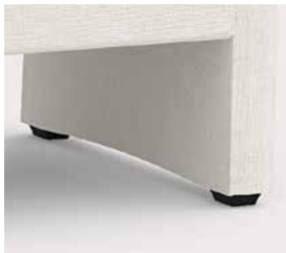
Low profile foot design enhances safety