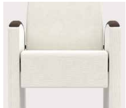
Optional clean-out space between arm and seat cushion