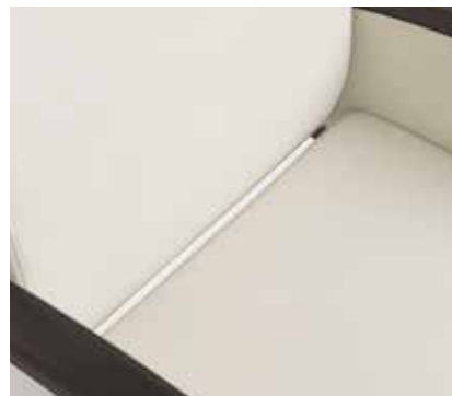
Ample clean-out spacing between seat and back