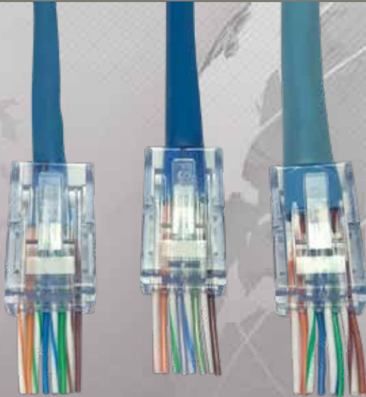
Cat5e Small Cat6

PoE/PoE+ & Data Applications Rated to 10 Gb Cat5e/6/6A