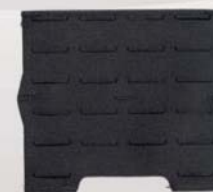
Side Tank Track™ laser cut panel