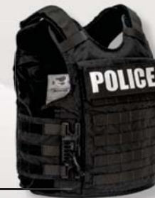
Shown with optional KWIQ Clips closure