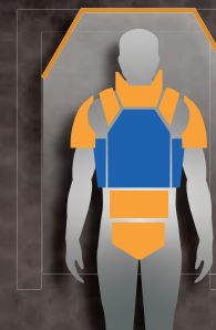
SCALABLE PLATE CARRIER