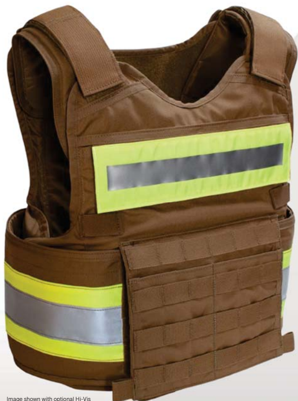
Image shown with optional Hi-Vis Cummerbund and ID panel