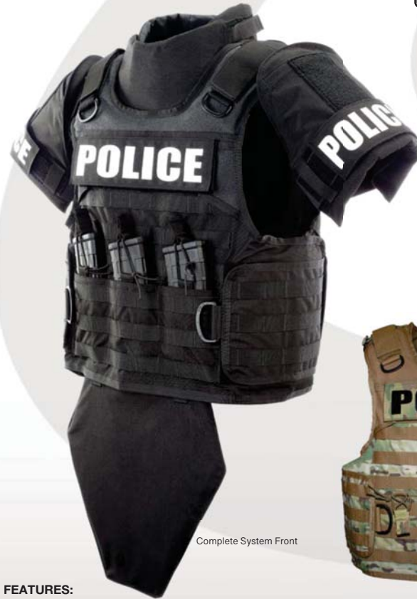
Complete System Front