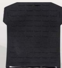
Front Tank Track™ laser cut panel