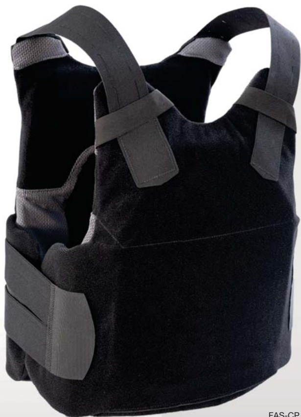
FAS-CP shown without Tank Track™ laser cut panels