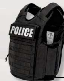
Shown with Standard Hook / Loop closure