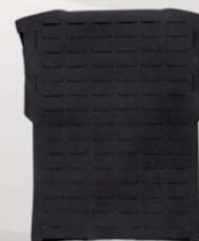
Back Tank Track™ laser cut panel