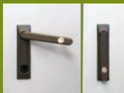
Locking Device & Swivel Recessed Handle