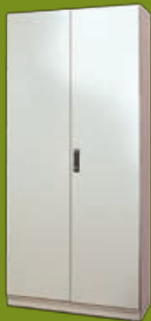
Cabinet Style Doors