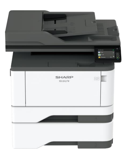
MX-B427W shown with optional accessories