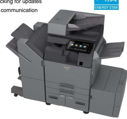
BP-70C45 shown with optional accessories