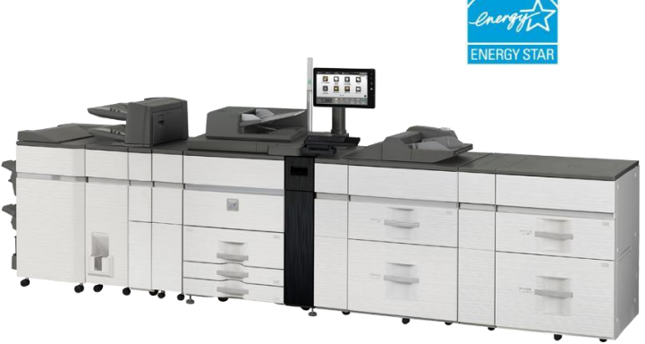
MX-M1206 shown with optional accessories