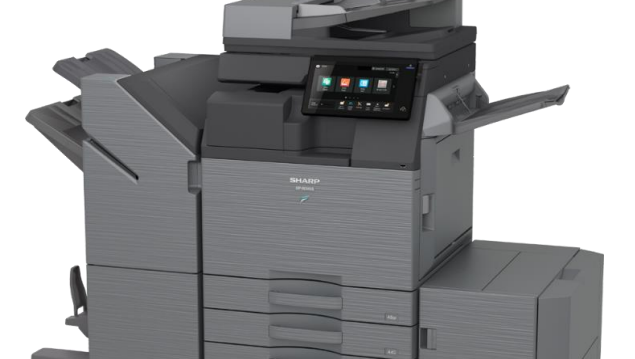
BP-50M45 shown with optional accessories