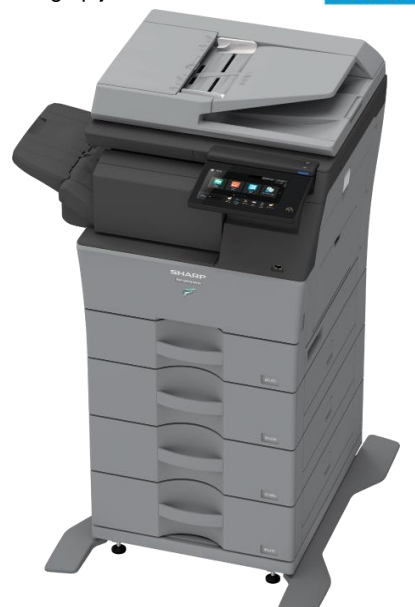
BP-B540WR shown with optional accessories