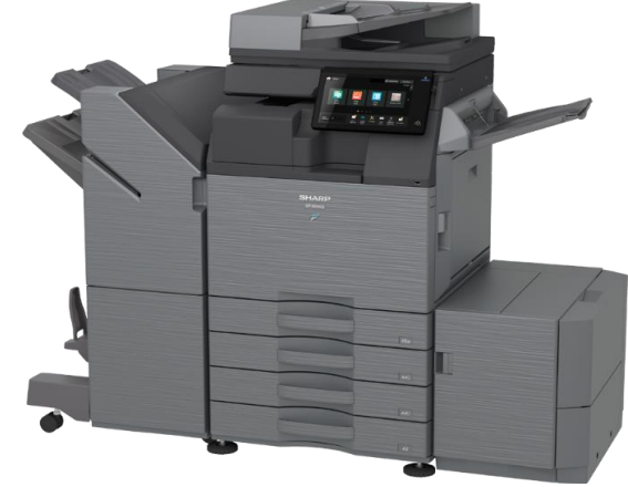
BP-50M65 shown with optional accessories