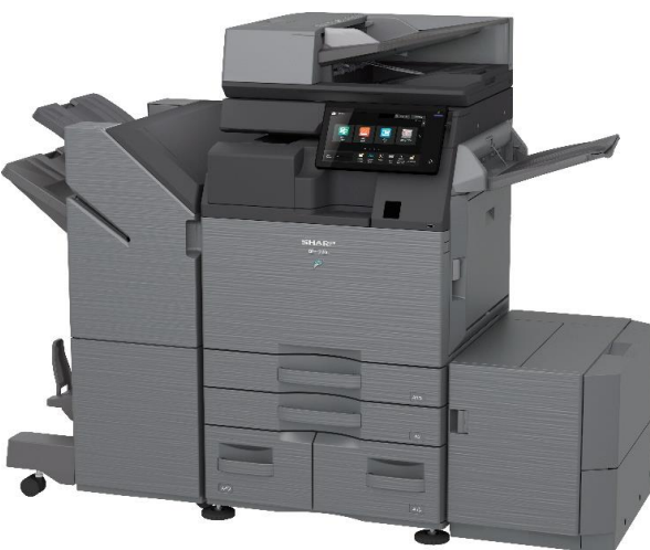
BP-70M45 shown with optional accessories