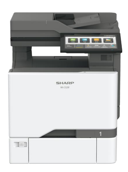
MX-C528F shown with optional accessories