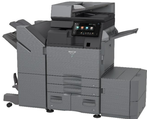
BP-70M65 shown with optional accessories