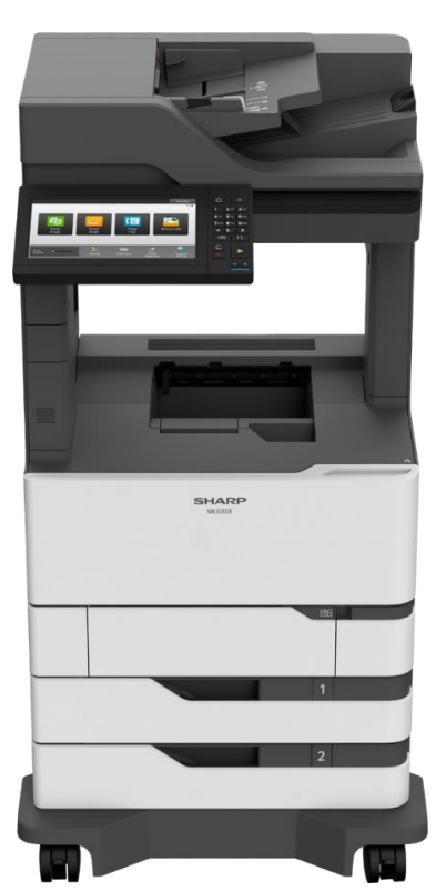
MX-B557F shown with optional accessories