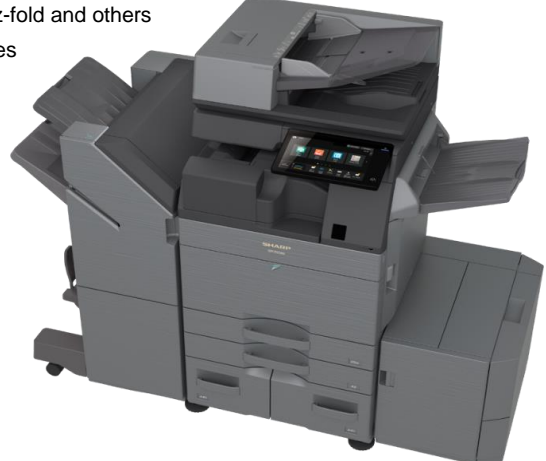
BP-70C65 shown with optional accessories