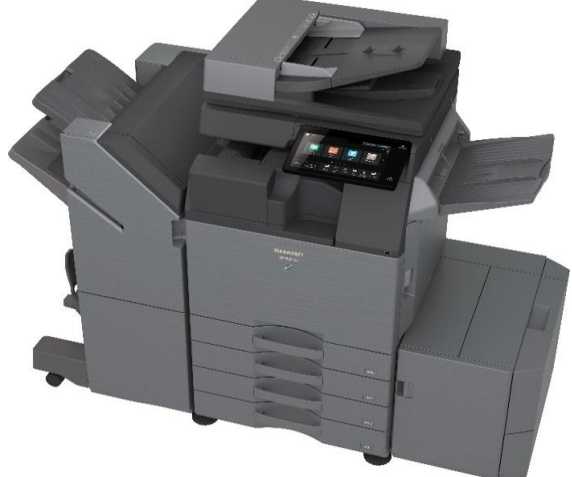
BP-50C45 shown with optional accessories