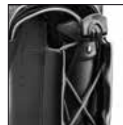
HAIX® FL Fit System