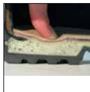
HAIX® MSL System