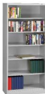
6-opening 78" High

Ideal when information is shared across offices