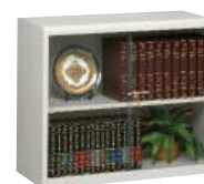
2-opening 30" High