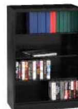
4-opening 52" High