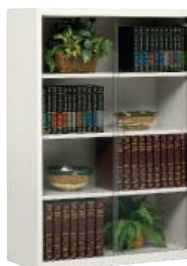
4-opening 52" HIGH