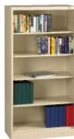
5-opening 66" High