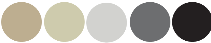
Sand (214) Champagne/ Putty (216) Light Grey (53) Medium Grey (2) Black (3)