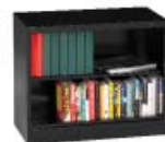
2-opening 28" High