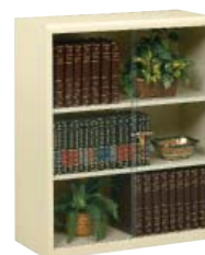
3-opening 42" High