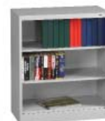
3-opening 40" High