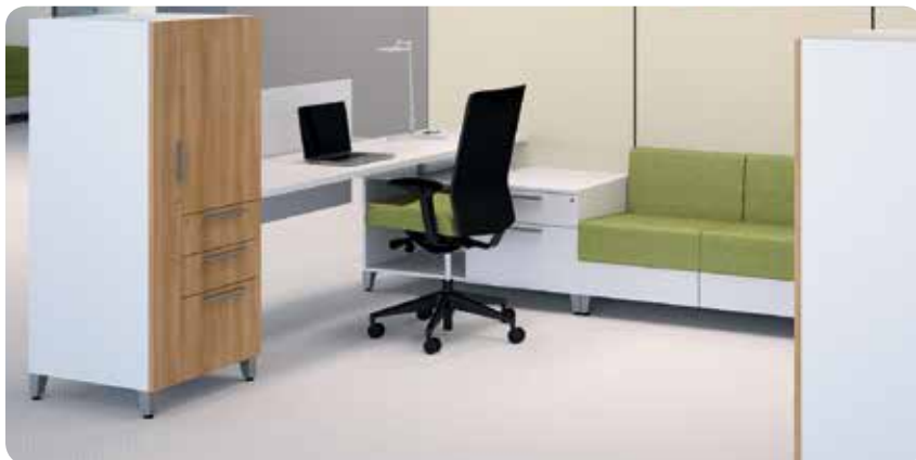
Involve multi-dimensional laminate storage and soft seating support active work with options that keep everything tucked away yet easily accessible.