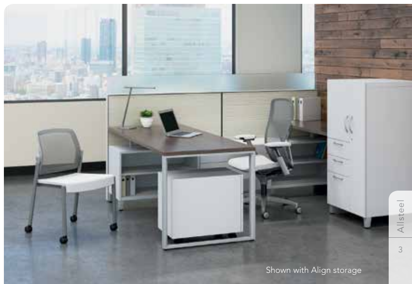
Shown with Align storage