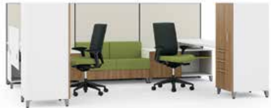
Remove a center panel and add soft seating to encourage collaboration in a shared workstation.

With real estate at a premium, you need agile workspaces that can accommodate future needs and changing workstyles. Today's office furniture must work harder than ever. That's why Terrace is built to last, with sturdy steel panels that stand up to years of use and reconfigurations.