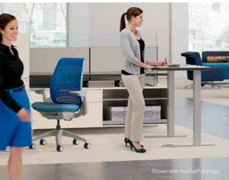
Shown with Involve® storage