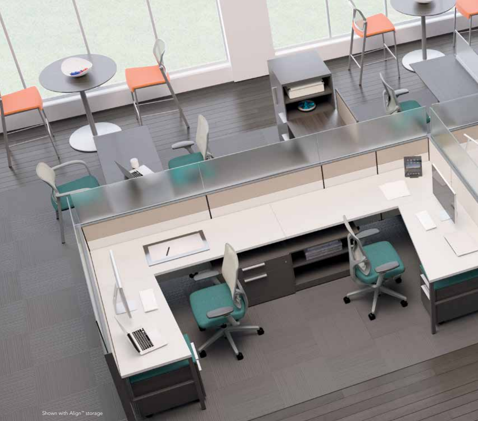
Shown with Align™ storage