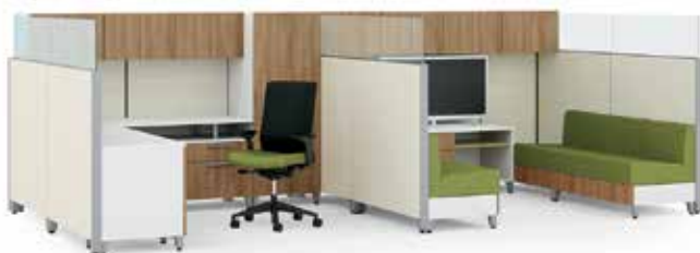
Convert a workstation to a meeting space by adding soft seating and lower-height storage.