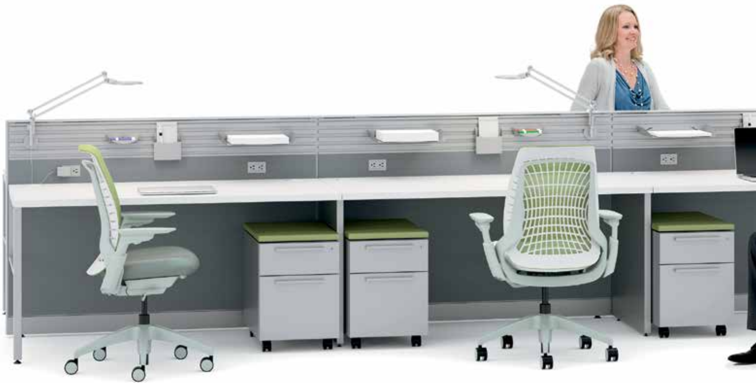
Shown with Align storage