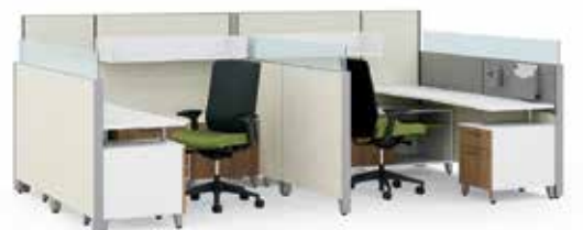
Create convenient touchdown areas or separate workspaces offering ample storage and natural light.