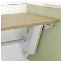
Sit-to-stand workspace easily adjusts up and down, so you can change postures quickly.

With Terrace, spaces can be as active as the people who use them. Worksurfaces of varying heights give people the freedom to adjust their work position. Soft seating integrated within primary work areas encourages collaboration. And flexible storage options tailor to individual needs.