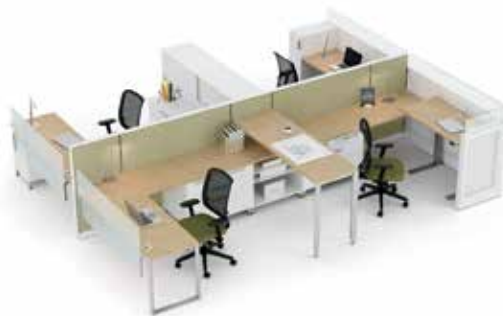
Standing-height tables and open storage create a comfortable teaming area for sharing ideas.