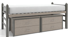
Single Bed Fascia Bed Rail Two Drawer Stackable Chests