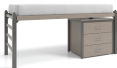
Single Bed Fascia Bed Rail Three Drawer Chest