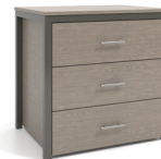
Chest Three Drawer