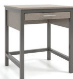
Table Desk Pencil Drawer