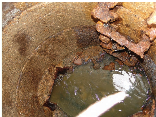
H_2S gas causes serious metal, concrete and pipe corrosion and can lead to costly repairs.

Treatment plants have numerous areas that will benefit from these products.