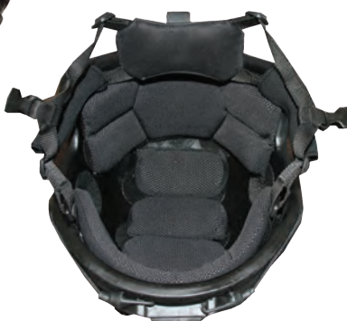
4D Combat Pads System