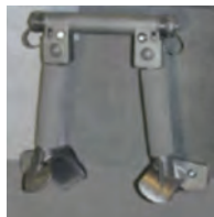
Assault Special Handle