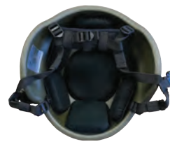
7 Pad System