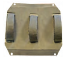
KENT Special Handle