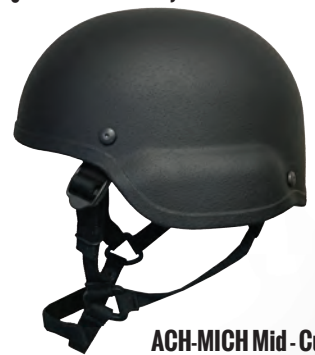
ACH-MICH Mid - Cut with Optional NVG Mount and Picatinny Rails