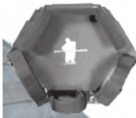
E.R.T. Special Handle