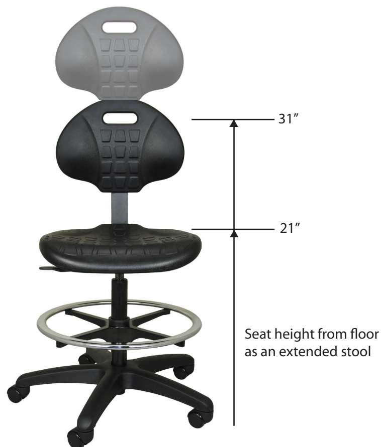
Model UR4001 XSP