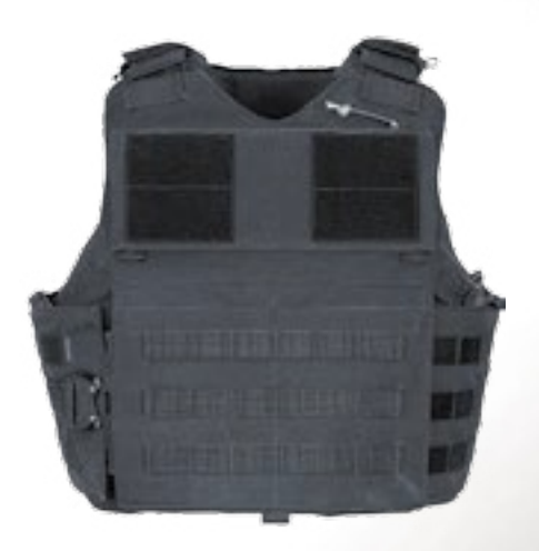
UPT Moody AV

All United Shield International ballistic packages are available to be used in the UPT Moody carrier