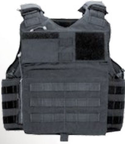
UPT Moody EV