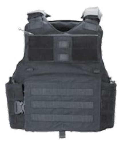
UPT Moody BC