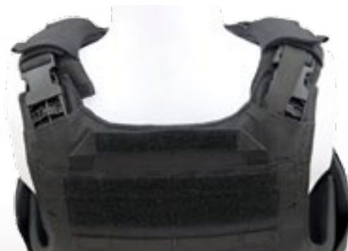
Rear Quick Release