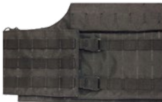
The "G-Hook" cummerbund attachment system

All ballistic (listed below) and non-ballistic accessories are attached to our vests using our unique "G-Hook" MOLLE attachment system, allowing for quick adjustment on the fly, flat low profile design and a sturdy attachment of the accessories to the vest.